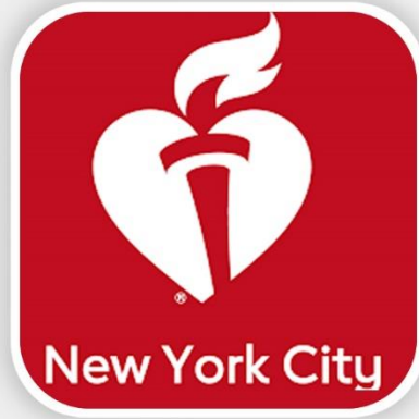
New York Heart Association