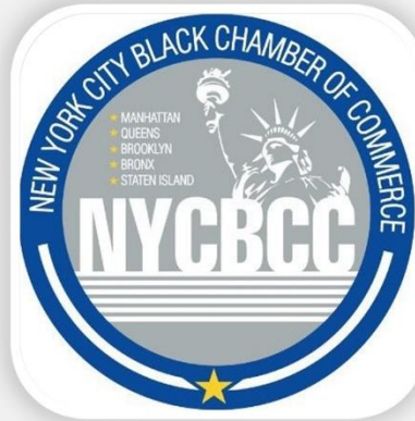
NEW YORK CHAMBER OF COMMERCE