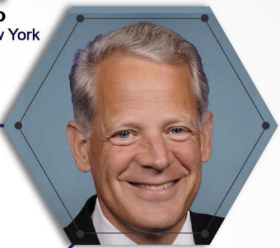
Steve Israel US Congressman