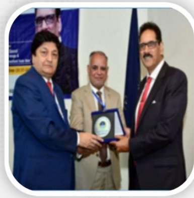
Agriculture University Faisalabad