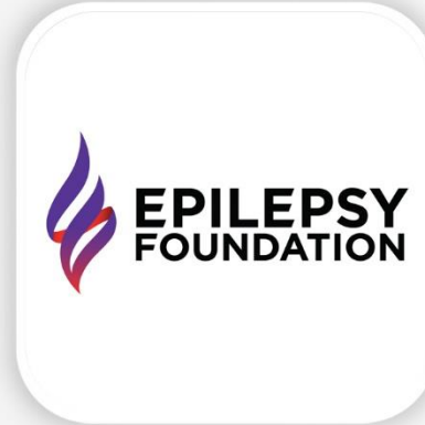
Epilepsy Foundation NYC