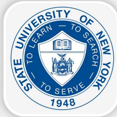
Suny New York