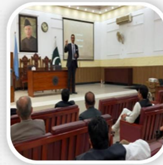
Govt Engineering Academy