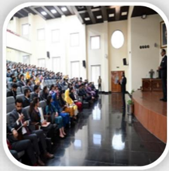
Pakistan CSS Academy