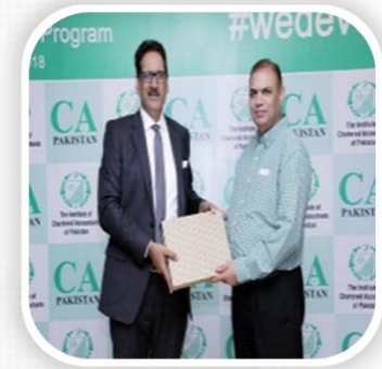
Institute of Chartered Accountants