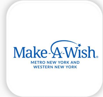
Make- A - Wish Foundation