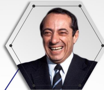
Mario Cuomo Ex Governor of New York