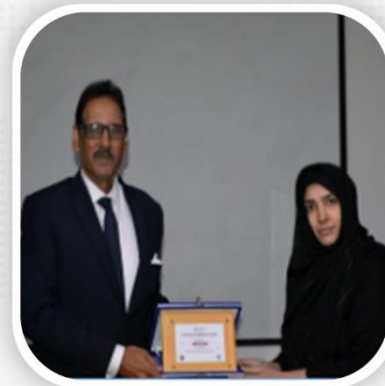
School of media studies