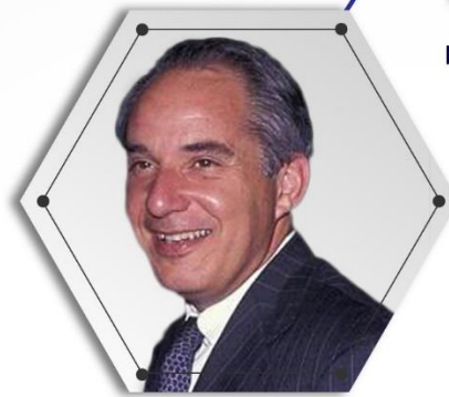
Robert Torricelli Ex US Senator