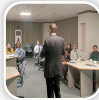
National Bank of Pakistan