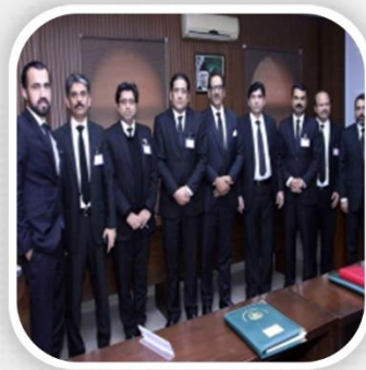
Sindh Judicial Academy