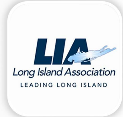
LONG ISLAND ASSOCIATION