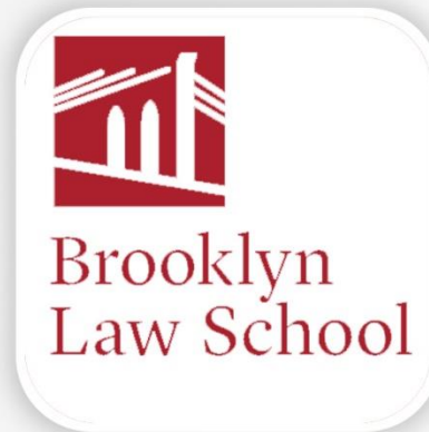
Brooklyn Law School