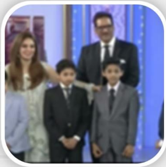
A Plus TV