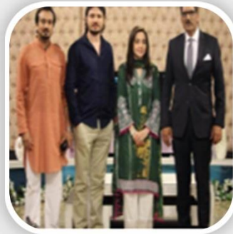
PTV Juggan show